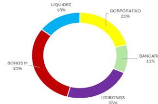
MULTIAR Carteras al cierre de 30-abr-24